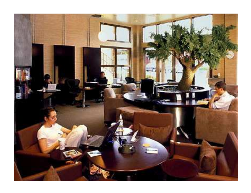
TheOffice at Santa Monica

People operating in co-working spaces describe their way of working as a "movement". Even if the spaces are very different in both services and culture, they shared 4 common values: "collaboration, openness, community and sustainability"<sup>2</sup>. The goal of the co-working spaces is to create a sense of community among users. Each organization has its own blog to share ideas and update information. Co-workers are expected to participate in the life of the community by bringing his own talent. The members should share their ideas with each other. Co-workers should not feel competition between each others.