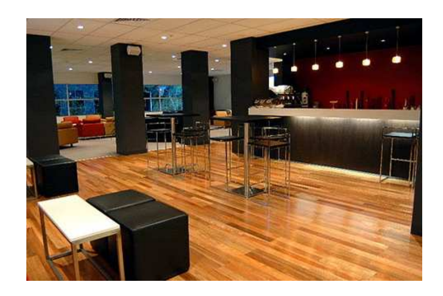
Bureaux Business Clubs at Sidney and Melbourne

CubeSpace, for example, offer services like assistance with marketing, graphic design and web development, even a masseuse propose discounted massages to users.