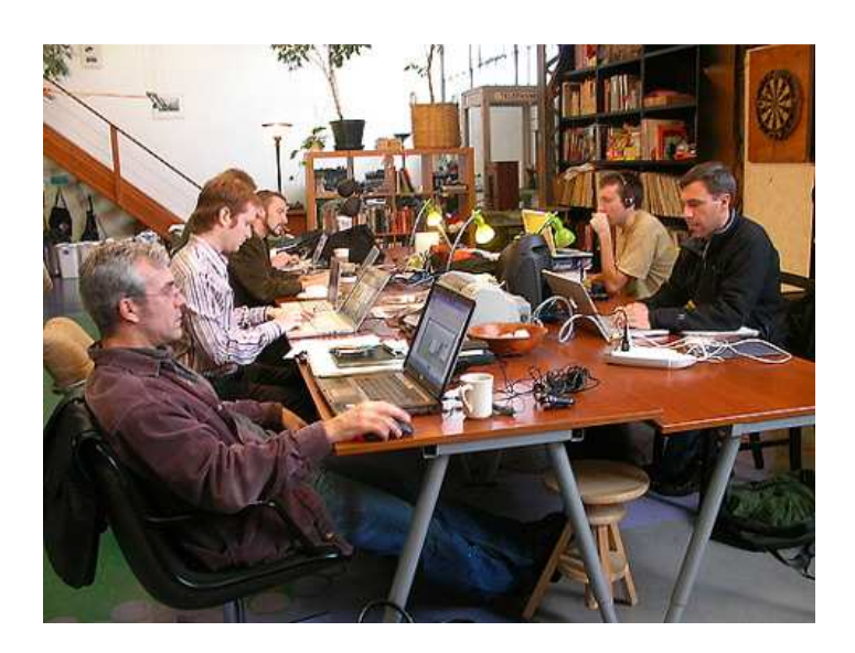
The Hat Factory at San Francisco